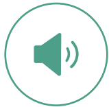
Harman co-engineered speaker