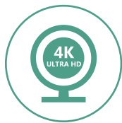
Ultra HD 4K Camera