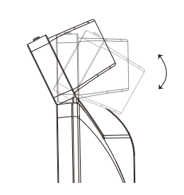
Adjust Camera Angle