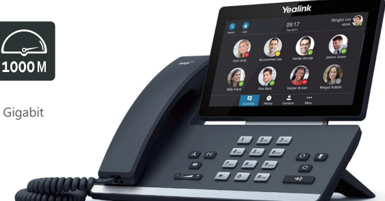
7-inch Multi-touch Screen