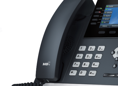
Optima HD Voice