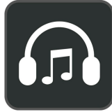
Brilliant Audio Performance