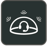
Four-Microphone Noise Cancellation

Yealink UH48 is a high-quality wired headset with ANC (Active Noise Cancellation) functionality. It is suitable for various office environments and offers a more immersive work experience.